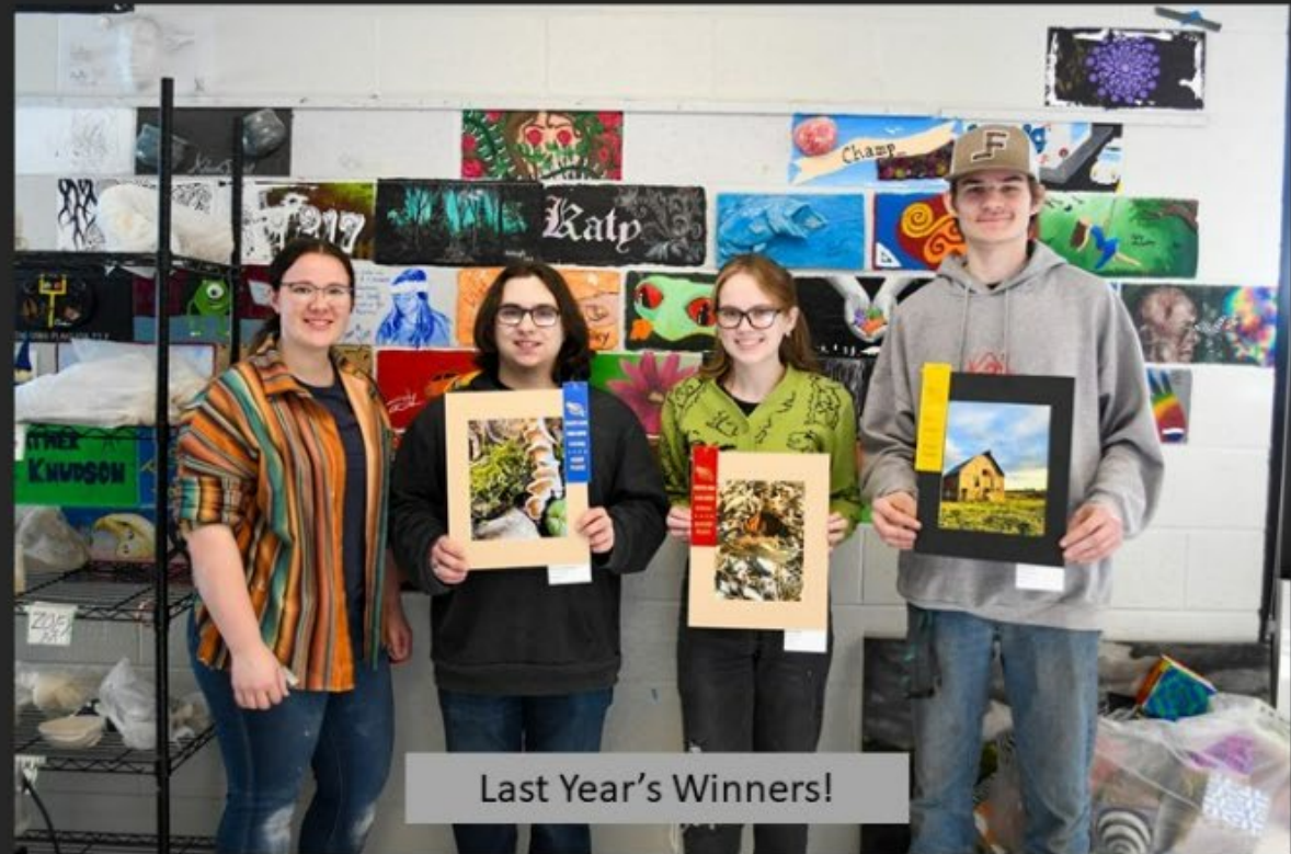
Last Year's Winners!