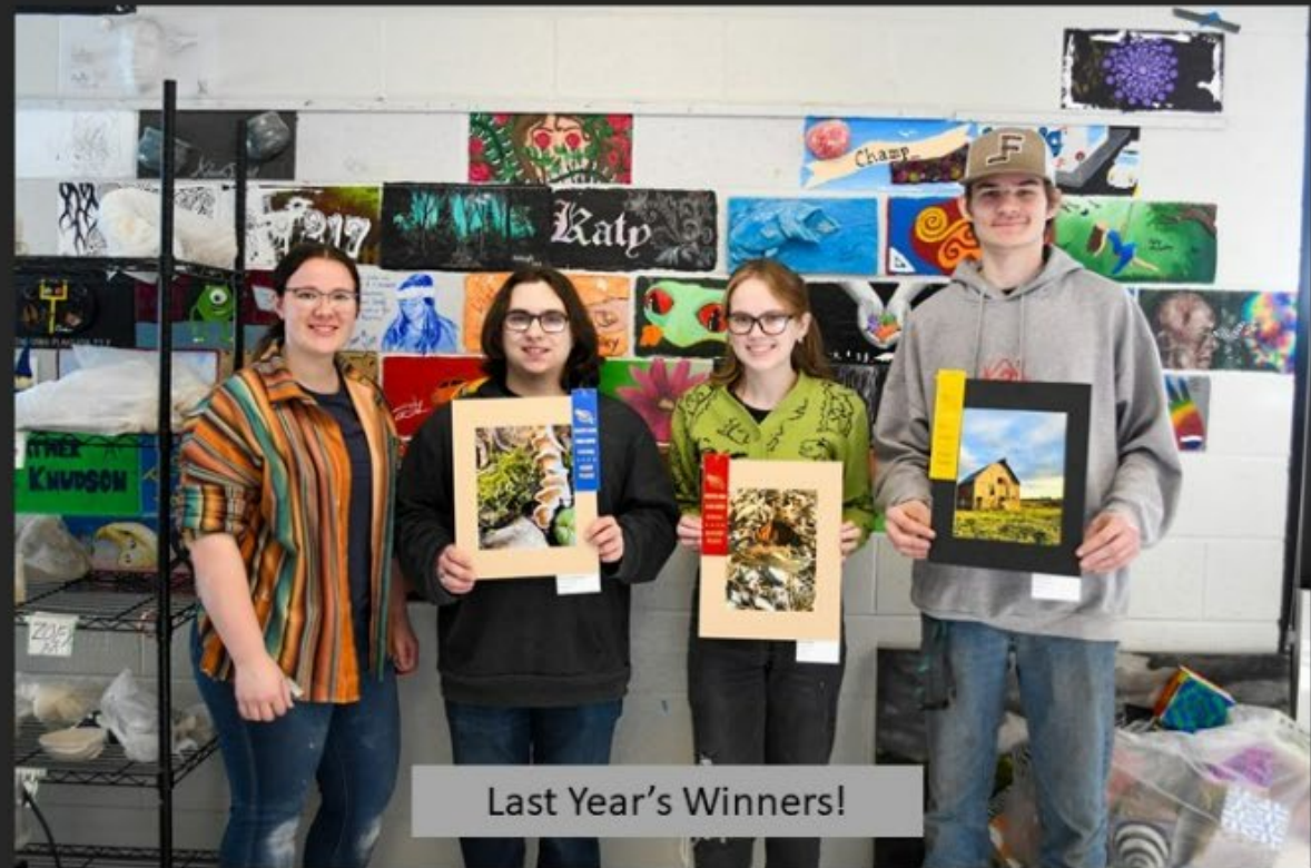
Last Year's Winners!