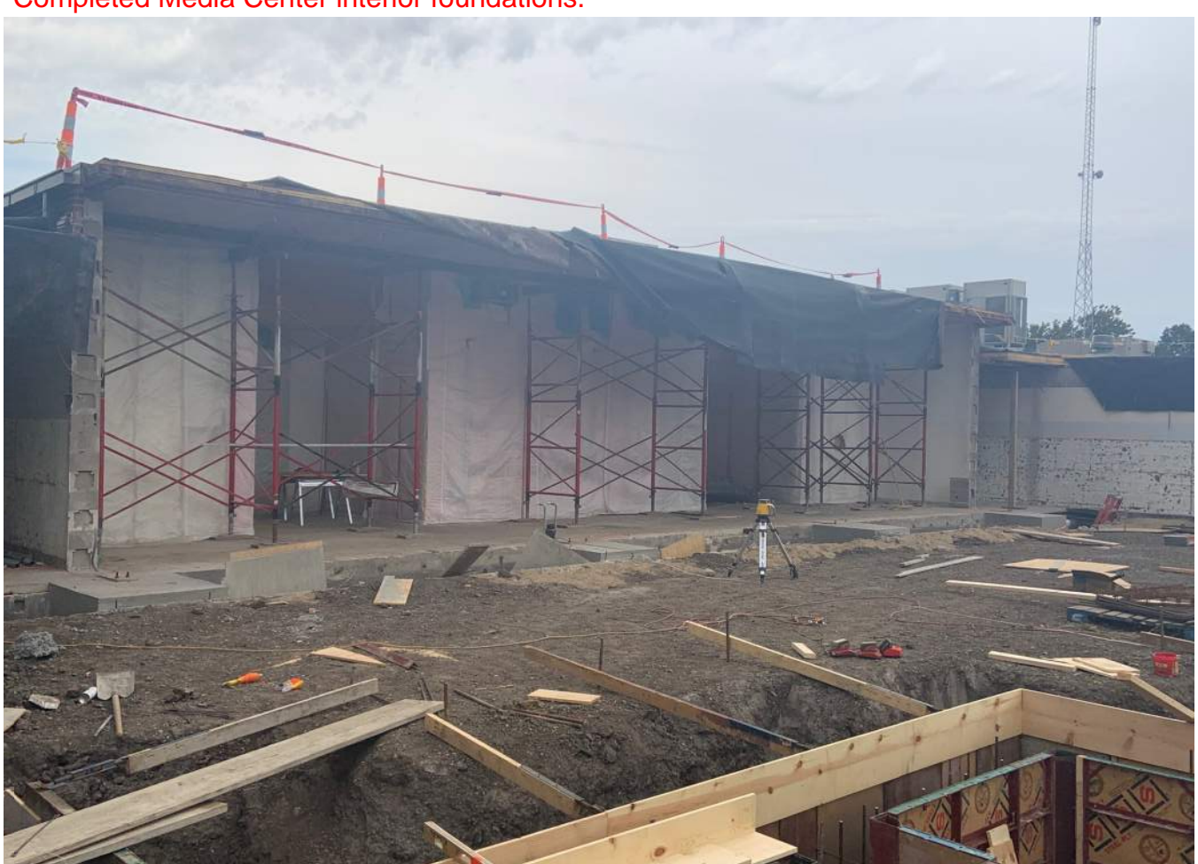
Forming Media Center exterior foundations.

Completed Media Center interior foundations.