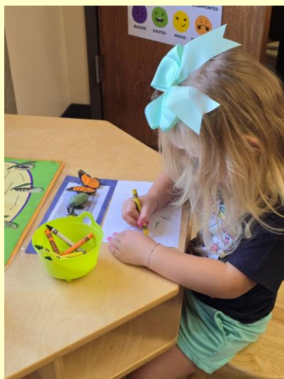
Electra draws at the science center while looking at the life cycle pieces.

We just finished learning about the life cycle of a butterfly. We are very excited to observe our caterpillars and hope the butterflies emerge soon.